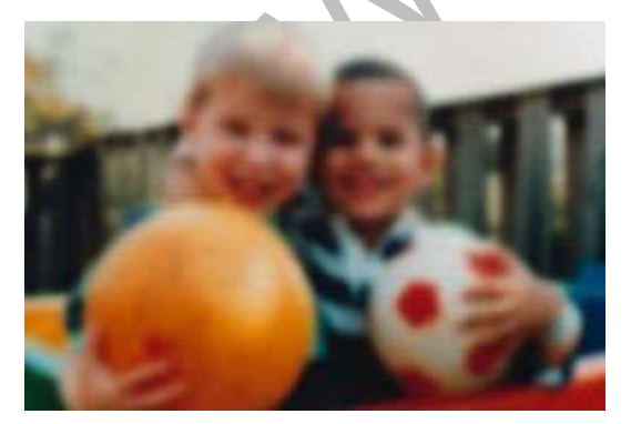
The same scene as viewed by a person with cataract